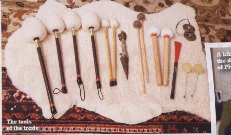
The tools of the trade