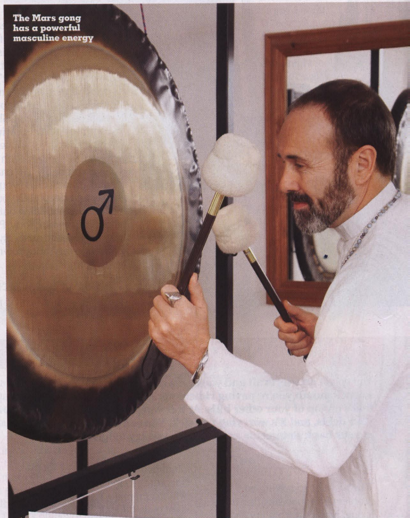
The Mars gong has a powerful masculine energy