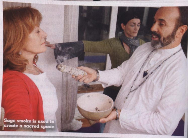
Sage smoke is used to create a sacred space