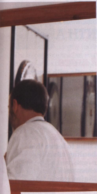
Feeling newly empowered